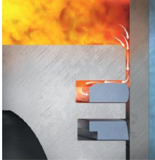
Sealing against combustion gases

45. The piston rings that GM installed in the Generation IV Vortec 5300 Engines fail to achieve their intended purpose of keeping oil in the crankcase and out of the combustion chamber. Further, the rings fail to achieve their intended purpose of trapping combustion gases in the combustion chamber and out of the crankcase.