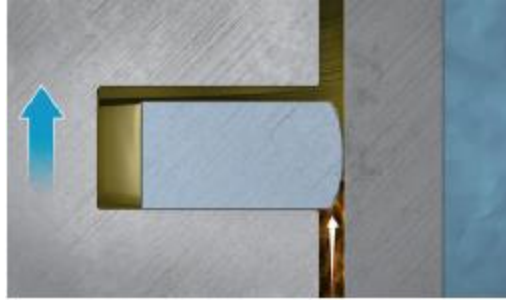
Fig. 1: Sealing through the groove side