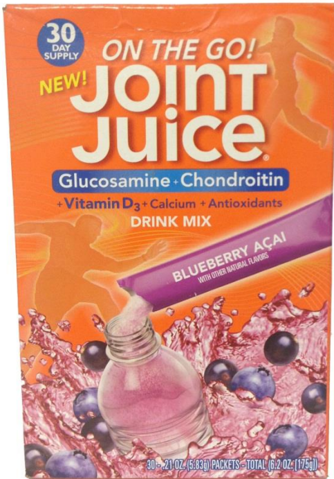
Drink Mix Box (Front)