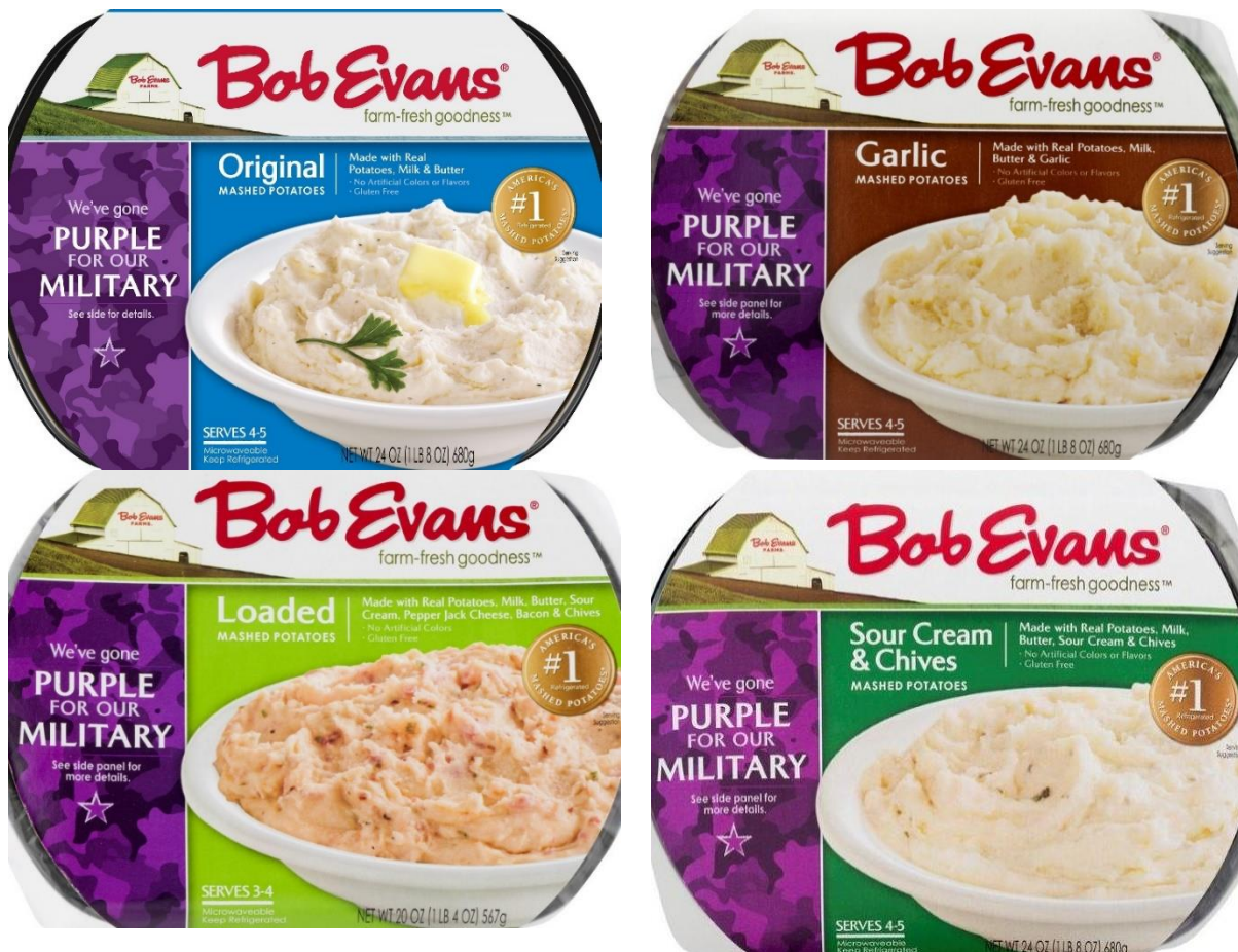
Original, Garlic, Sour Cream & Chives, Loaded (clockwise)

5. The relevant back label statements relate to the (i) characterizing ingredients for the variety (i.e., Made with Real Milk & Butter for Original), (ii) freshness of potatoes (“Made with 100% Fresh Potatoes,” “Made with Fresh Potatoes”), (iii) No Artificial Colors or Flavors.