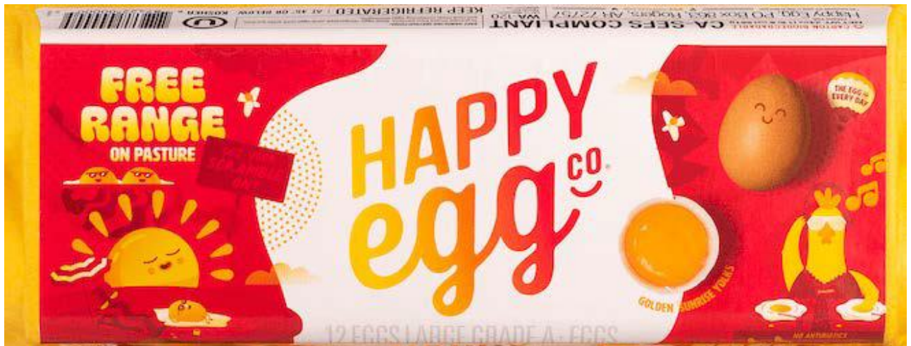
19 Figure 1: Free Range on Pasture

15 29. THG systematically use the well-known “pasture” terminology in order to deceive 16 consumers. Indeed, there is no plausible reason for THG to use the term “pasture” to describe its 17 free range eggs other than to propagate the misconception that the Eggs are pasture raised. This 18 can be seen from images of the Egg cartons set forth below: