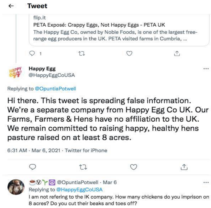
1 Figure 6

2 3 4 5 6 7 8 9 10 11 12 13 14 15 16 17 18 19 20 21 22 23 24 25 26 27 28