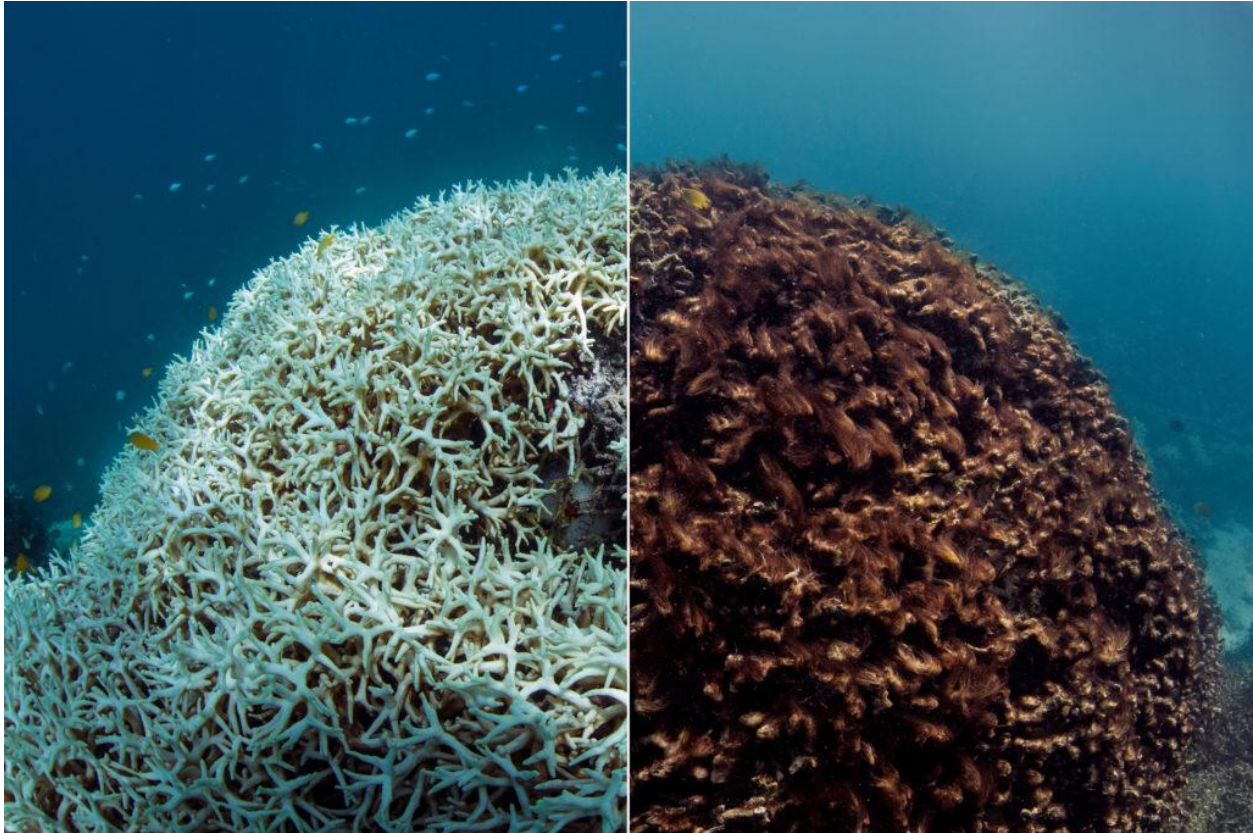
Left: Bleached Coral

3. However, coral reef ecosystems are threatened by pollution. Relevant to this matter, certain chemicals found in sunscreen lead to the “bleaching” of coral reefs, resulting in death and damage, as seen below: 3