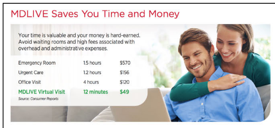
( Figure 1 , showing a fee comparison between a “MDLive Virtual Visit” and other traditional medical visits).

10. Patients first download the MDLive App from Apple’s App Store or Google’s Play Store and register an account. Although the MDLive App is free to download, patients pay a $49 fee for a virtual doctor consultation (the “MDLive Virtual Visit”). See Figure 1.