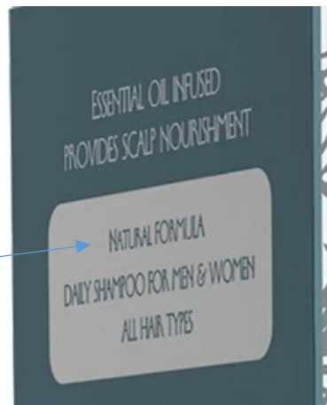
Side of Product's Package