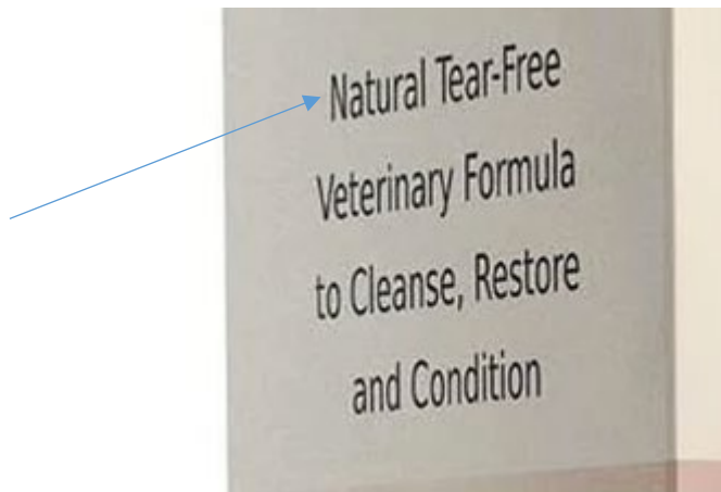
Side of Product's Packaging