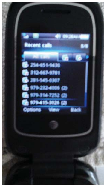
979-415-3026 – 2 calls