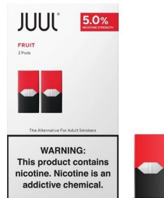
Recent JUUL Design