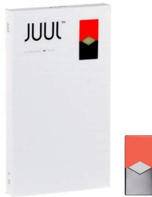
Original JUUL Design