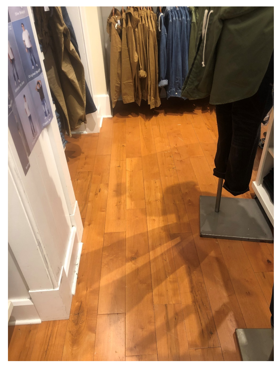
Figure 1 – American Eagle, 518 Beaver Valley Mall, Monaca, Pennsylvania 15061