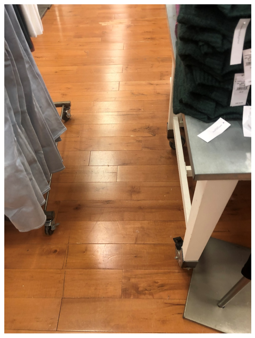
Figure 2 – American Eagle, 518 Beaver Valley Mall, Monaca, Pennsylvania 15061

42. In addition, Plaintiff's Investigator examined other of Defendant's American Eagle retail locations and determined the same problems existed that were present in the location visited by Plaintiff, as depicted in the following images: