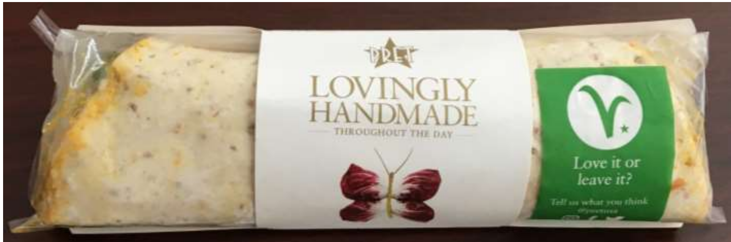
Above is a picture of Pret A Manger's Chakalaka Wrap as it appears to the consumer.