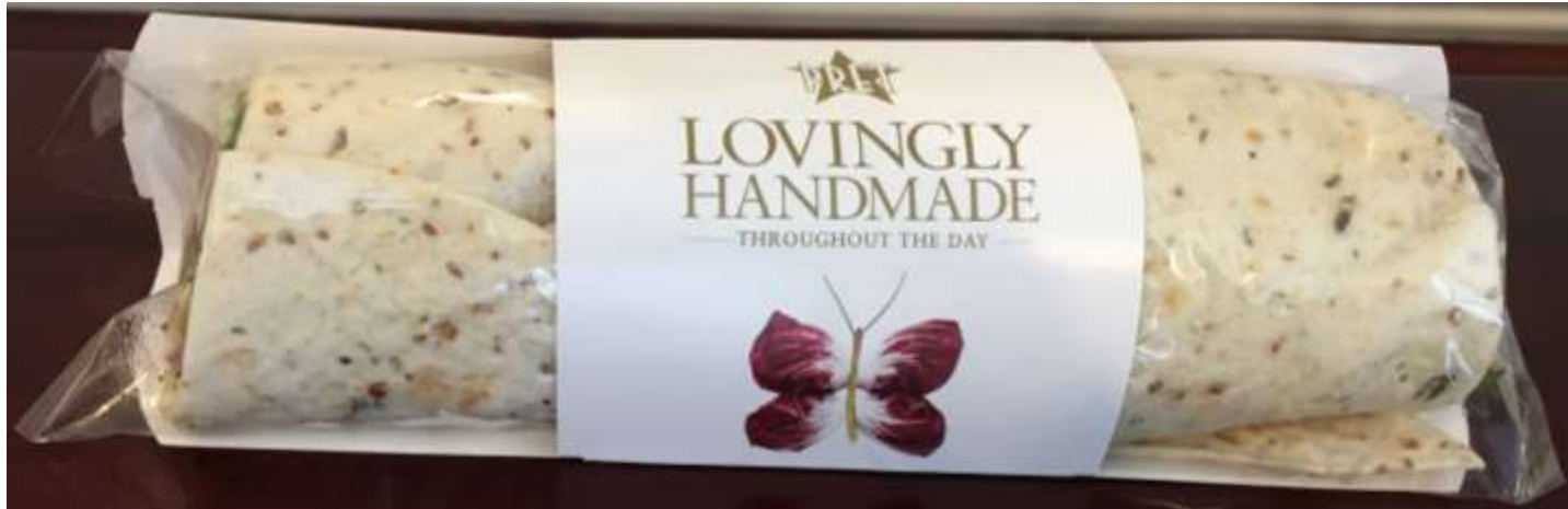
Above is a picture of Pret A Manger's Mustard, Chicken and Swiss Wrap as it appears to the consumer.