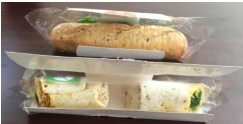
Above is a picture of an opened Turkey and Avocado Caesar on Artisan compared to an opened Chakalaka Wrap that has hidden air that is non-functional slack-fill. The cardboard portion of the Chakalaka package hides the air between the halves of the Wrap.