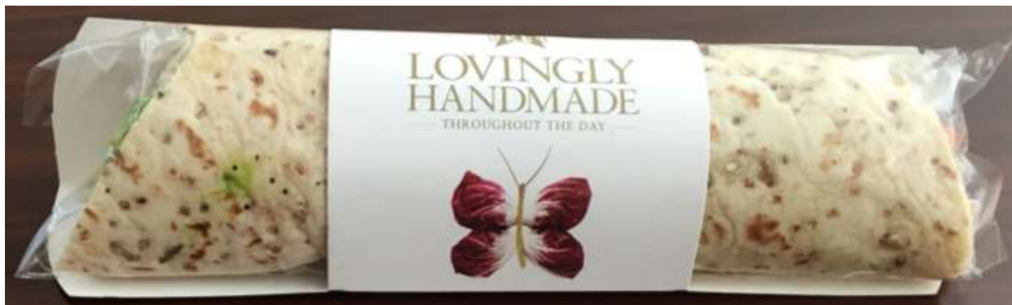
Above is a picture of Pret A Manger's Avocado Pine Nut Wrap as it appears to the consumer.