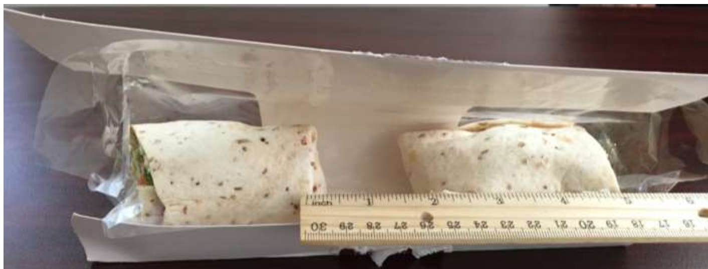
Above is a picture of the Greek Falafel Wrap showing approximately 1.75 inch of empty space in the package that is hidden by the cardboard shroud. All of this space is unexpected and unnecessary, so it is non-functional slack-fill. Pret A Manger's deceptive practices portray the Greek Falafel Wrap package as having more contents than it actually has.