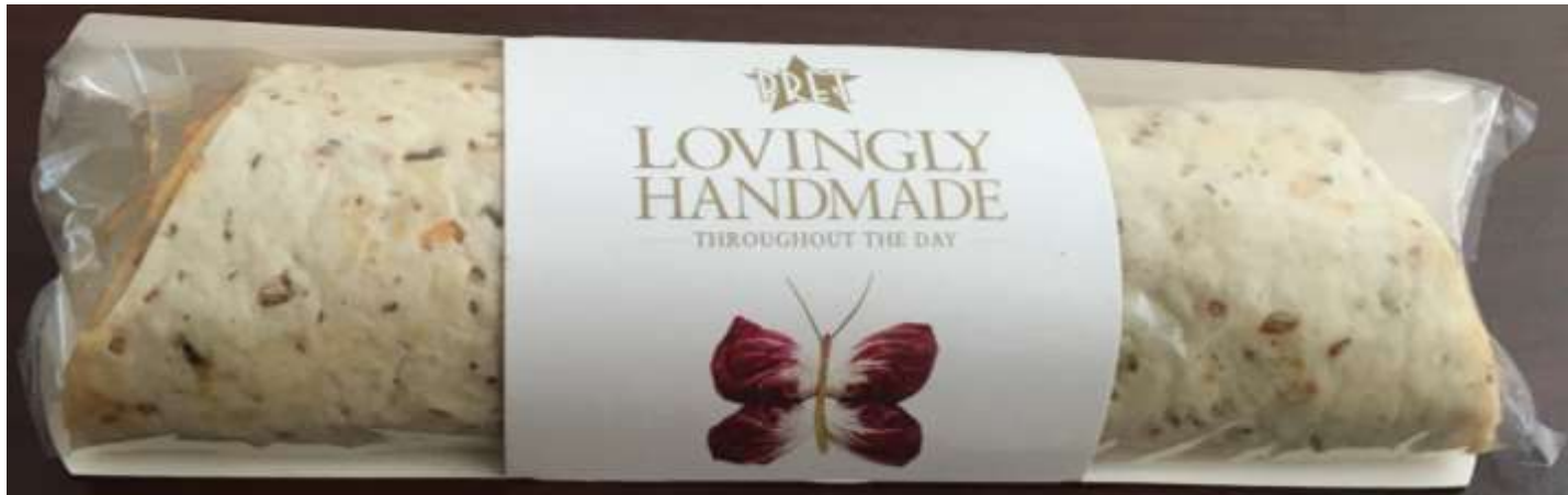
Above is a picture of Pret A Manger's Bang Bang Chicken Wrap as it appears to the consumer.