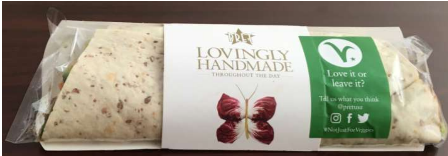
Above is a picture of Pret A Manger's Green Goddess Turkey Wrap as it appears to the consumer.