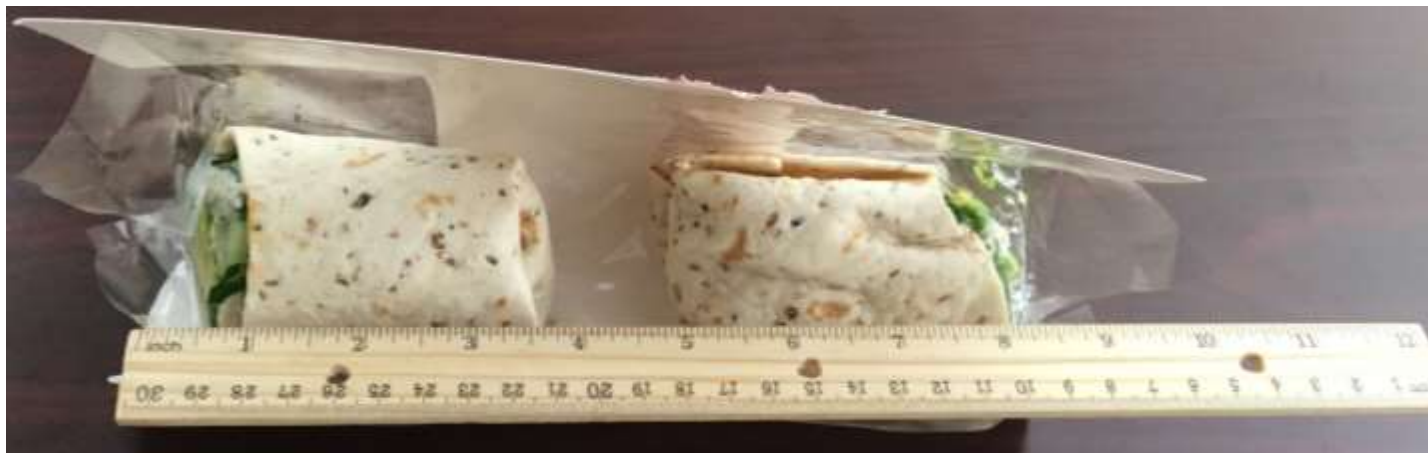
Above is a picture of the Green Goddess Turkey Wrap showing approximately 1.5 inches of empty space in the package that is hidden by the cardboard shroud. All of this space is unexpected and unnecessary, so it is non-functional slack-fill. Pret A Manger's deceptive practices portray the Green Goddess Turkey Wrap package as having more contents than it actually has.