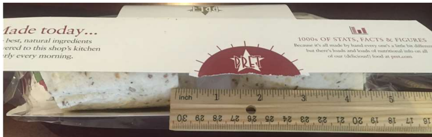
Above is a picture of the Mustard, Chicken and Swiss Wrap showing approximately 1.5 inch of empty space in the package that is hidden by the cardboard shroud. All of this space is unexpected and unnecessary, so it is non-functional slack-fill. Pret A Manger's deceptive practices portray the Mustard, Chicken and Swiss Wrap package as having more contents than it actually has.