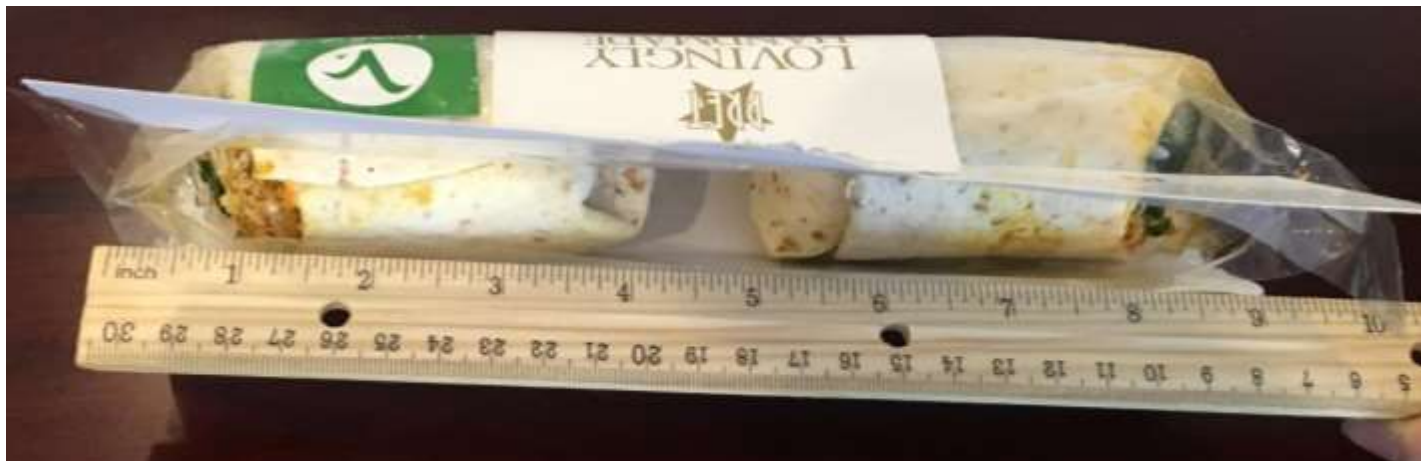
Above is a picture of the Chakalaka Wrap showing approximately 1 inch of empty space in the package that is hidden by the cardboard shroud. All of this space is unexpected and unnecessary, so it is non-functional slack-fill. Pret A Manger's deceptive practices portray the Chakalaka Wrap package as having more contents than it actually has.