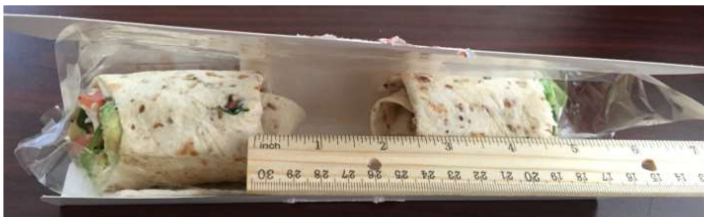
Above is a picture of the Avocado Pine Nut Wrap showing approximately 2.5 inches of empty space in the package that is hidden by the cardboard shroud. All of this space is unexpected and unnecessary, so it is non-functional slack-fill. Pret A Manger's deceptive practices portray the Avocado Pine Nut Wrap package as having more contents than it actually has.