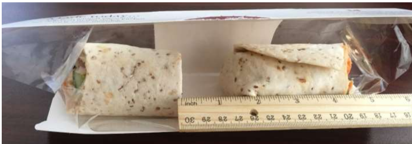
Above is a picture of the Bang Bang Chicken Wrap showing approximately 1.25 inches of empty space in the package that is hidden by the cardboard shroud. All of this space is unexpected and unnecessary, so it is non-functional slack-fill. Pret A Manger's deceptive practices portray the Bang Bang Chicken Wrap package as having more contents than it actually has.