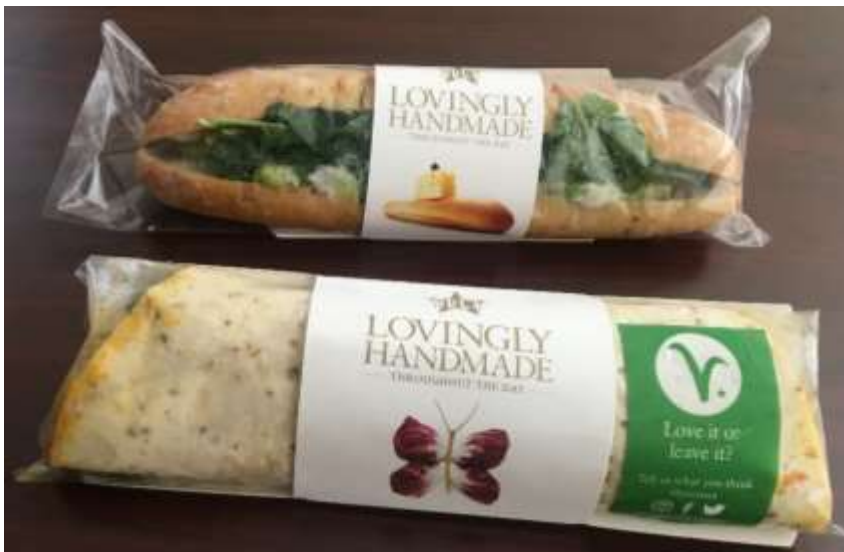
Above is a picture of an unopened Turkey and Avocado Caesar on Artisan to an unopened Chakalaka Wrap.