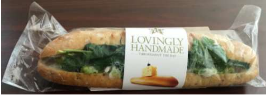
Above is a picture of the Turkey and Avocado Caesar on Artisan. The cardboard portion of the packaging does not hide any air that is non-functional slack-fill.