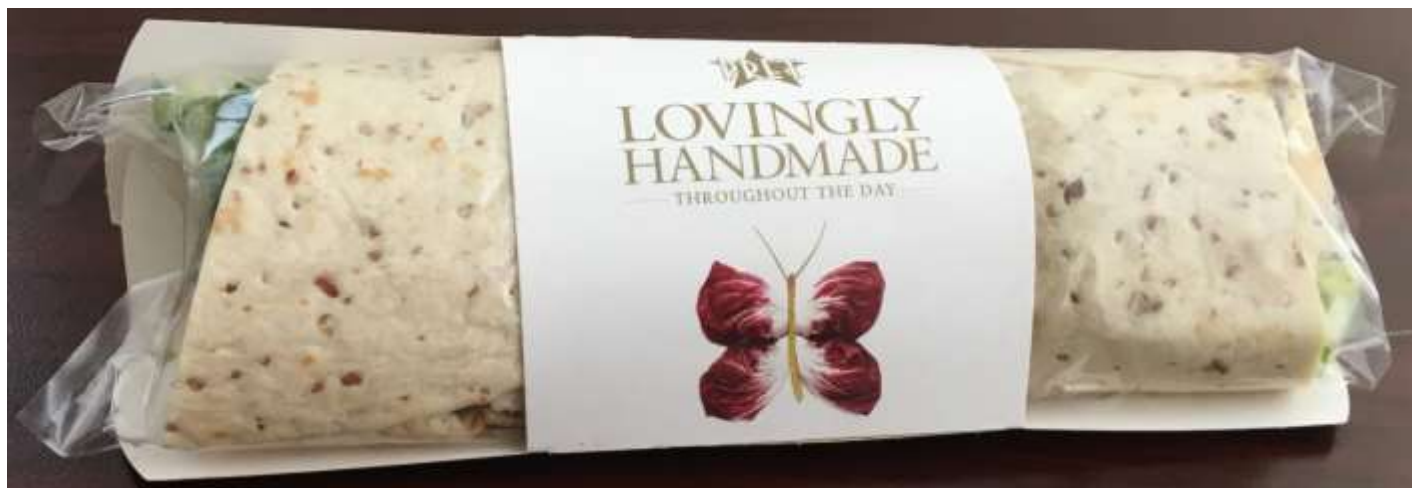
Above is a picture of Pret A Manger's Greek Falafel Wrap as it appears to the consumer.