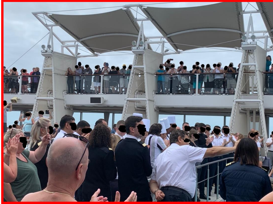
Picture of March 21, 2020 event aboard the Celebrity Eclipse wherein passengers and crew members gathered in close proximity to one another to recognize the heroics of medical professionals and first responders during the COVID-19 pandemic.

19. In sum, despite knowing that COVID-19 was and/or likely was present aboard the vessel during the subject voyage, CELEBRITY glaringly failed to follow even the most basic safety precautions after acquiring such notice, such as reasonably warning passengers of the potential presence of COVID-19 aboard the vessel, timely quarantining passengers and crew members aboard the vessel, timely providing passengers and crew members masks and/or timely requiring them to observe physical distancing measures.