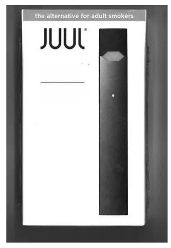
(2015 - Spring, 2018)