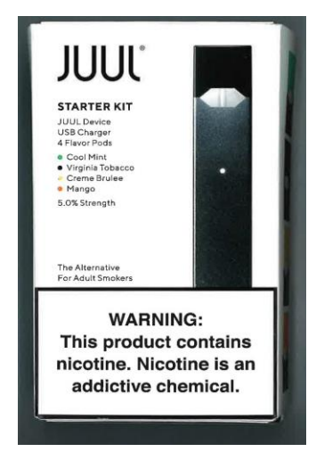
(Spring, 2018 to present)

exceptionally potent dose of nicotine, that JUUL is delivering doses of nicotine that are several times higher than those allowed in normal cigarettes, that the efficiency with which the product delivers nicotine into the bloodstream increases its addictiveness, that it can be more addictive than traditional cigarettes and that it poses serious health risks.