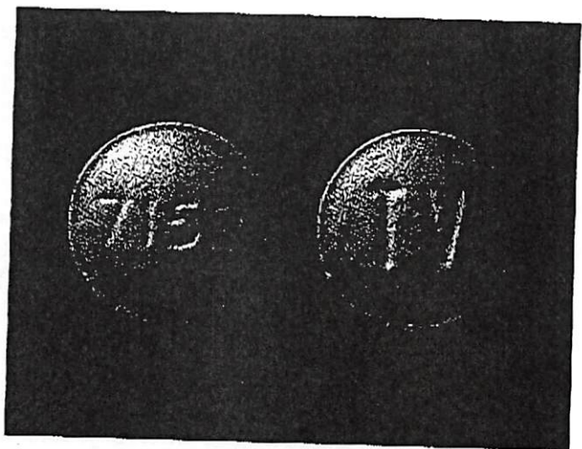
Simvastatin 10 mg Tablet Description Light-pink, round "7153" on one side "TV" on the other side