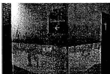
A sign for the men's bathroom on the second floor of the bus terminal, where dozens of people have been arrested and charged with lewdness this year.

Port Authority police officers have arrested more than 60 people this year in the bus terminal on public lewdness charges, a sevenfold increase over the same period last year. Most of those arrested were accused of masturbating in the second-floor bathroom. According to court records, they were observed by plainclothes officers, who were often standing next to them at an adjacent urinal.