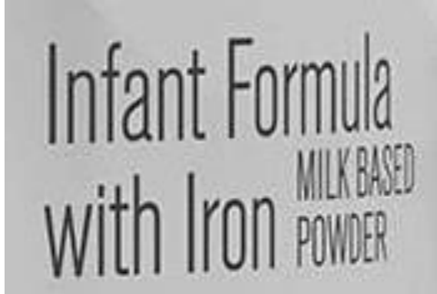
Infant Formula Product