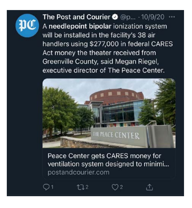
155. Purchasers relied upon these representations that they were obtaining a product that would not only make the air cleaner but also eliminate the COVID-19 virus. For example, numerous purchasers used CARES ACT funds to pay for Defendant's Products:

b. "Small Businesses: As payments from the second round of the Paycheck Protection Program (PPP) begin rolling out, small businesses can apply funds to utility expenses and other related costs as a result of the COVID-19 pandemic."