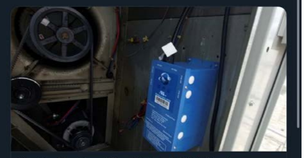
Device On Good Day Cafe's HVAC System Purifies Air Amid COVID-19 Pandemic minnesota.cbslocal.com