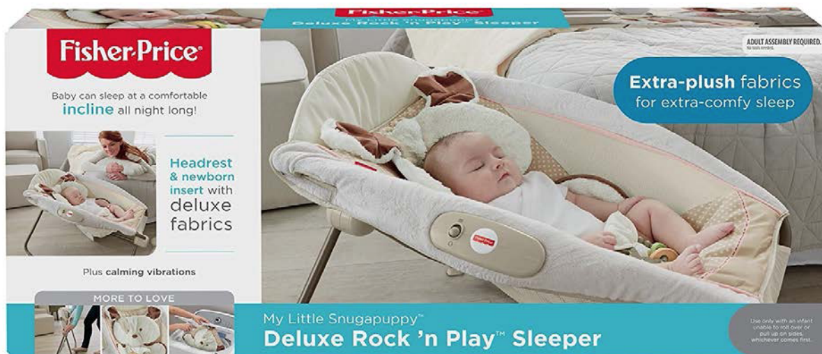
Above: Figure 6

96. One of the principal means of in-store advertising is the box in which the product is packaged. The boxes prominently tout that the product is suitable for all-night sleep as illustrated by the figures below showing typical packaging: