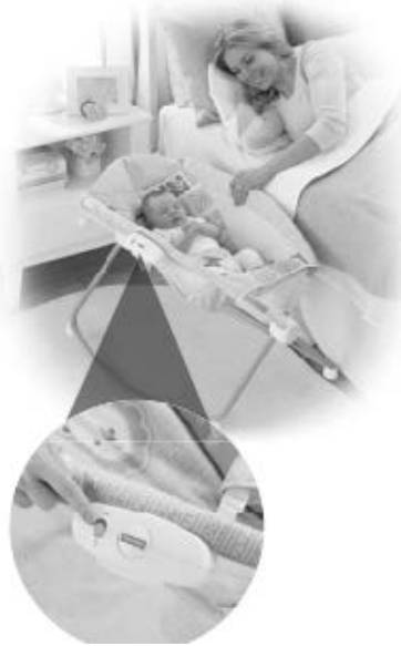
Above: Figure 11

130. This image is misleading because it implies that mothers can sleep when their babies are in the sleepers, while, at the same time, Defendants warn that babies should be supervised when in a Rock 'n Play Sleeper. Mothers cannot supervise their children when they are themselves sleeping.