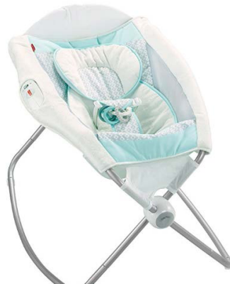
Above: Figure 5

33. Some “Premium” and “Deluxe” models, such as the deluxe model immediately above, have additional padding around the head.