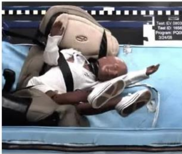
BIG KID BOOSTER SEAT Model 338 — No Side Wings