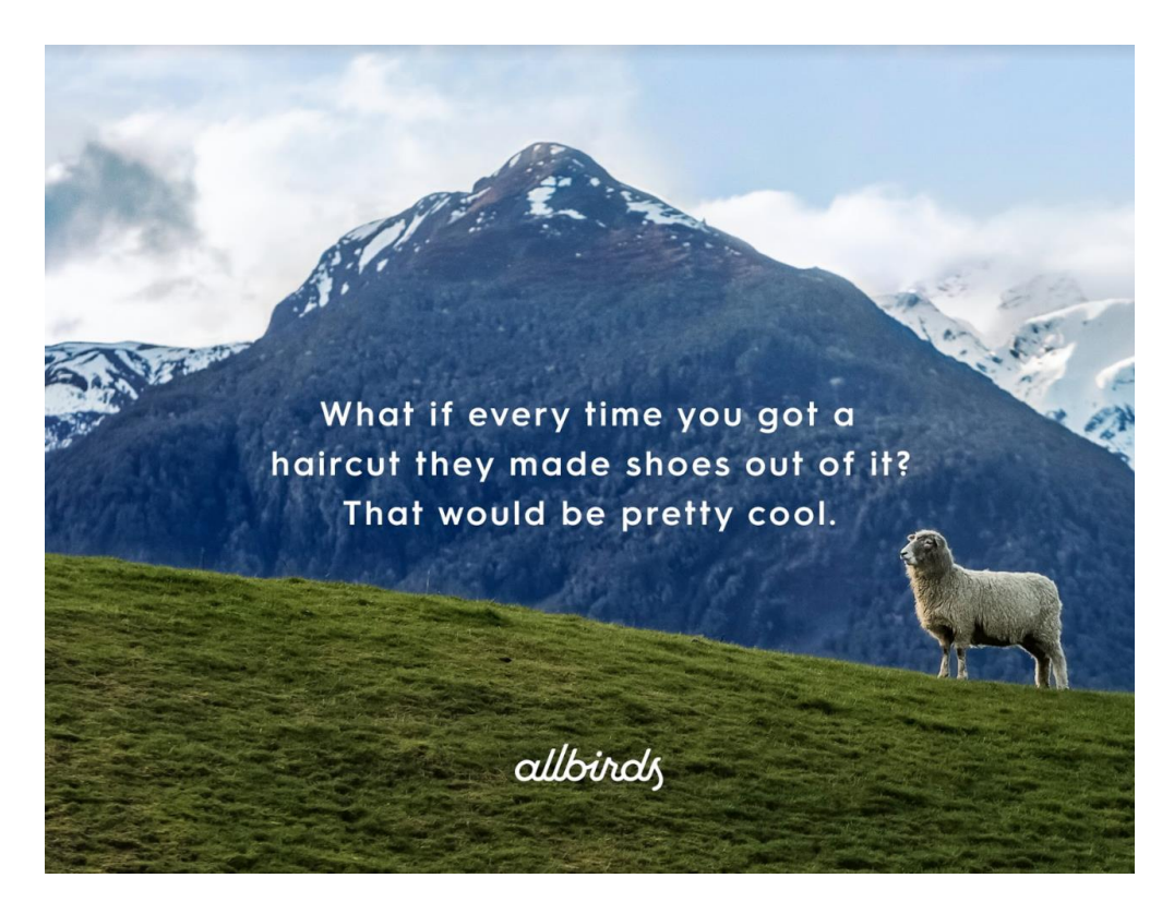
20. Another ad states, "Behind every shoe is a sheep. And behind every sheep, is another sheep, probably.