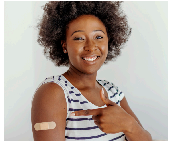
Depo-Provera shots are taken every 3 months, which can be easier to remember than a daily birth control pill.

Any medication can have side effects. Depo-Provera often causes irregular menstrual bleeding. Most users will experience a change in their menstrual cycles that is either irregular and unpredictable bleeding, or lack of bleeding entirely. During the first year, about 50% of users stop having periods. The menstrual effects