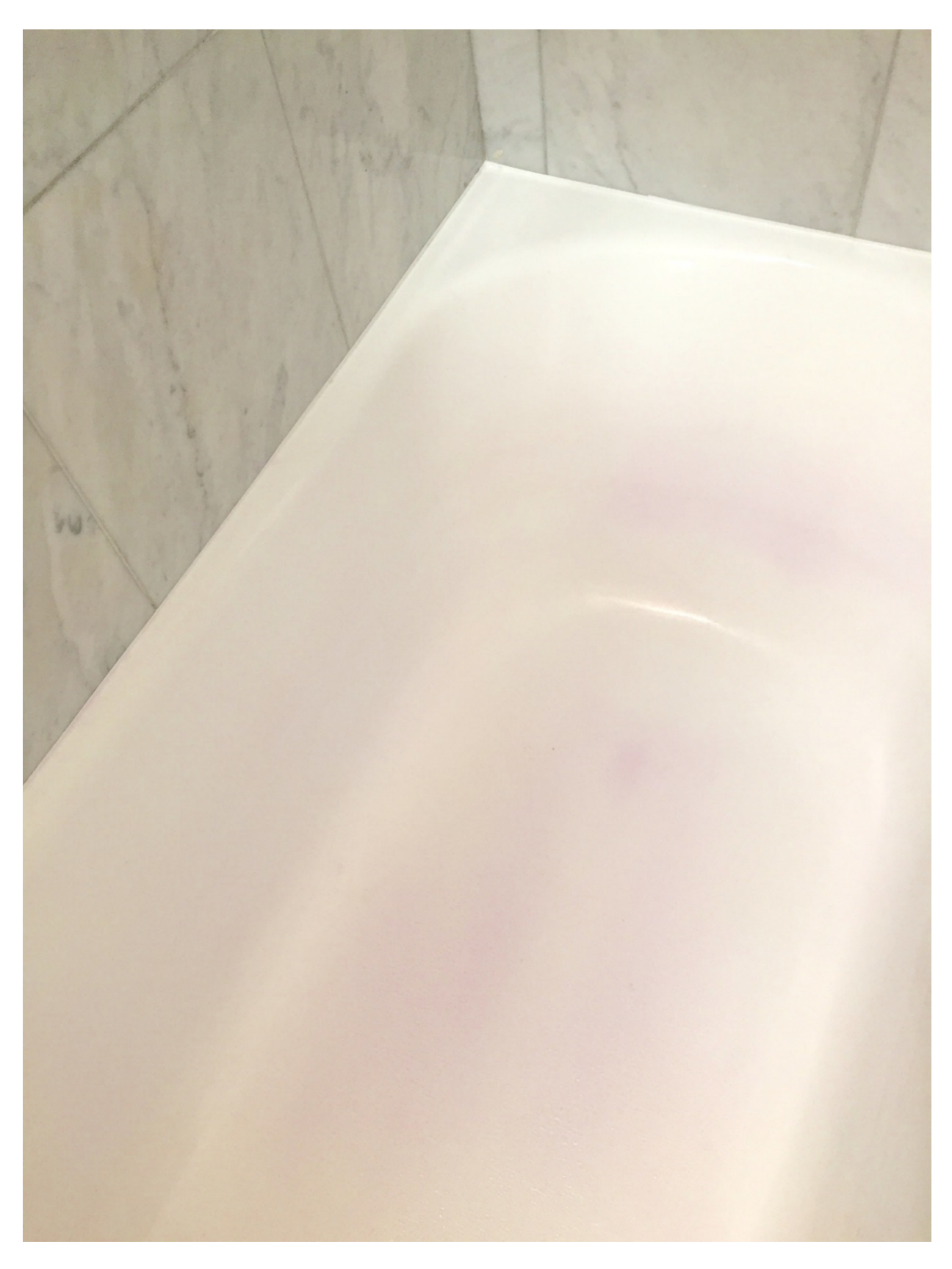
Stains in bathtub.