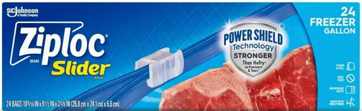
Ziploc Slider Storage Bags