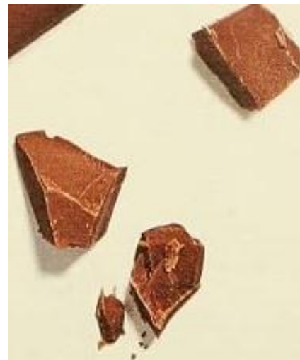
Dipped in Organic Chocolate