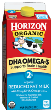
Compl. ¶ 17.