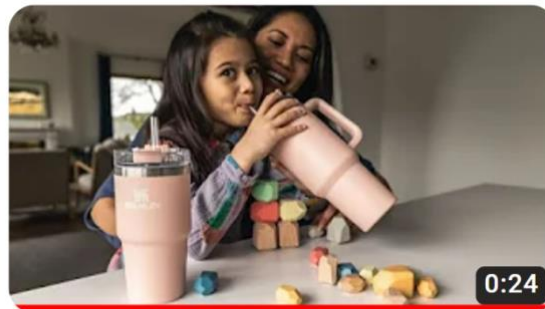
7 8 9 10 11 12 13 The Stanley Adventure Quencher: ⋮ 14 Now in 4 sizes 15 98K views • 1 year ago

1 27. PMI markets its products as safe, fashionable choices for conscientious 2 consumers, especially those leading young families. PMI's 3 advertisements feature cups in various colors popular with women. Its 4 ads often show the cups being used by young women exercising or 5 interacting with children. 22 One PMI advertisement on YouTube shows a 6 child drinking from a Stanley cup alongside her mother. 23