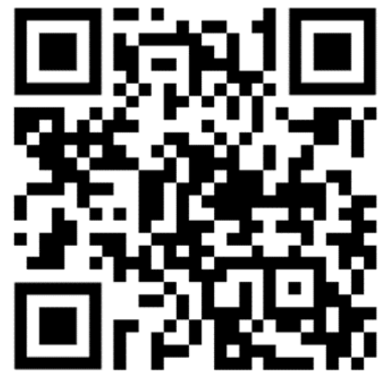
21 Fig. 2. A young mother promotes using a Stanley cup while breastfeeding in an advertisement paid 22 by PMI. The paid partnership video is still available on Instagram and can be watched by scanning 23 the QR Code as of the date of filing.