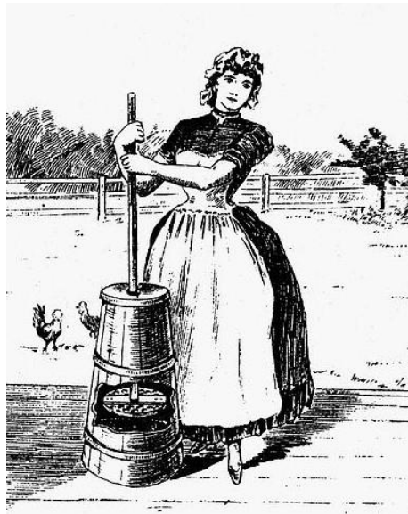
Old-fashioned Butter Churning

24. The two sides of the package state “We use fresh, never frozen real potatoes and real ingredients like milk and butter. Finally, comfort food that you can feel comfortable with.”