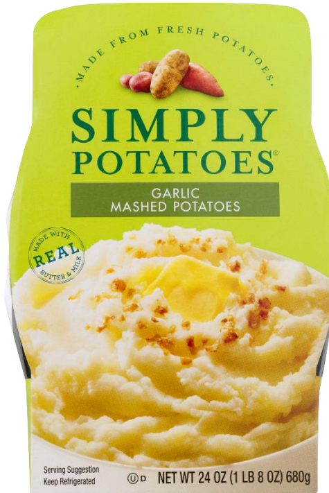
Principal Display Panel

21. Approximately an inch to the right of the melting butter square is a circle which emphasizes “Made With Real Butter & Milk.”