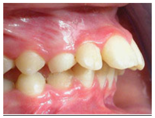
Figure 3 – Excessive Overjet

66. Overjet refers to the horizontal extension of the upper front teeth over the lower front teeth. Excessive overjet is another form of malocclusion that is more prevalent in children who use pacifiers, and is a condition where the upper front teeth are significantly further forward than the lower front teeth, as depicted below: