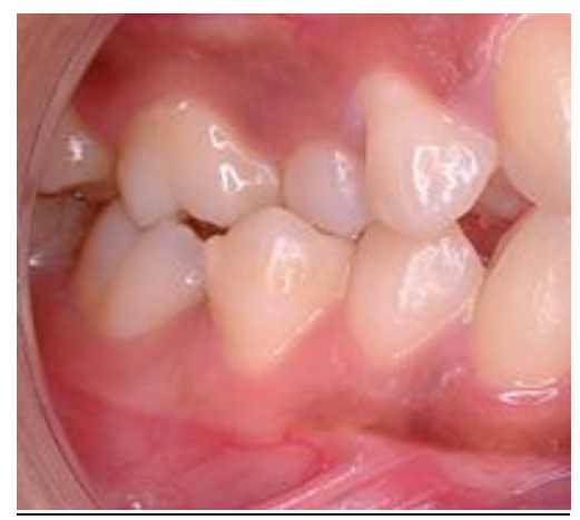
Figure 4 – Class II Malocclusion

71. Adair et al. found that "[c]lass II primary canine relationships on one or both sides were significantly more common among the pacifier group," regardless of pacifier type, as compared to habit-free children. Adair et al., supra note 2, at 439. Among users of "orthodontic" pacifiers, Adair found that the "occurrences of Class II primary canines and distal step molars were statistically significantly greater among the users of functional exercisers." Id. at 440. Dimberg et al. similarly showed that there was a statistically significant higher rate of Class II malocclusions in pacifier users. Supra , note 10.<sup>14</sup>