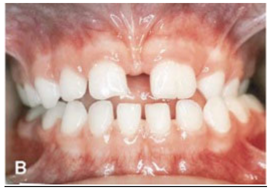
Figure 6 - Diastema^{17}