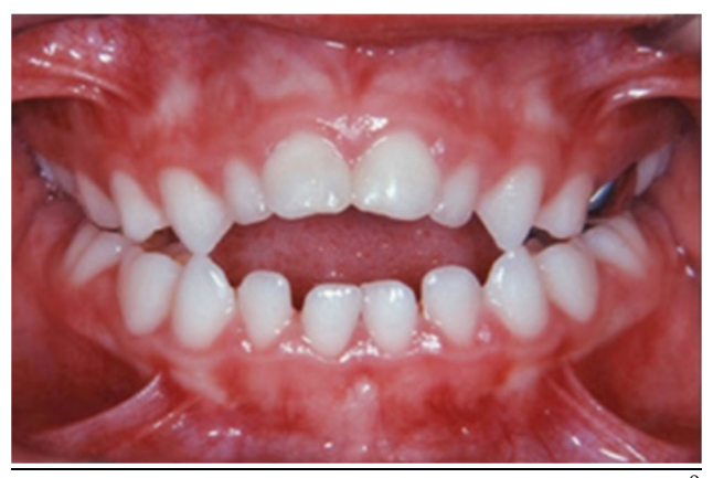
Figure 1 – Pacifier-Induced Anterior Open Bite<sup>9</sup>

54. An anterior open bite ("AOB") is a condition where the front teeth fail to touch, and there is no overlap between the upper and lower incisors, as depicted in the image below: