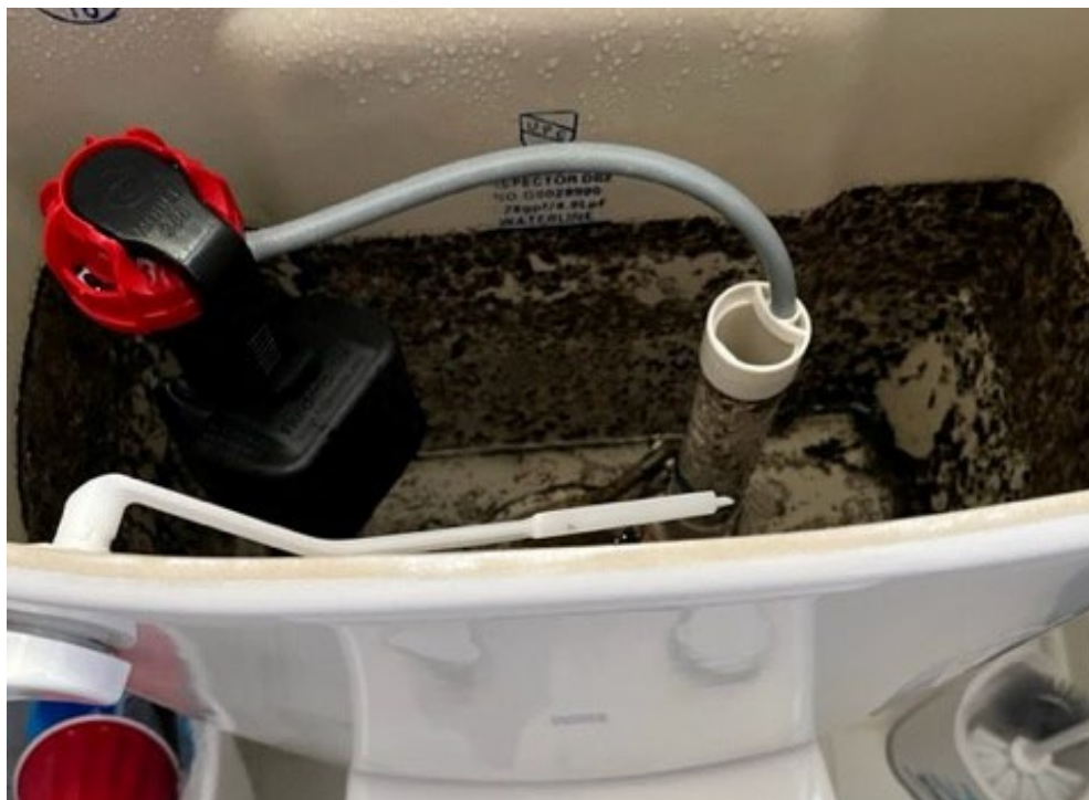
Discoloration and soot-like substance in a toilet tank in Plaintiff Kymm Watson's home

152. This discolored water often is and was accompanied by sewage smells emitted from residents' sinks, shower/bath drains, toilet bowls, and toilet tanks.